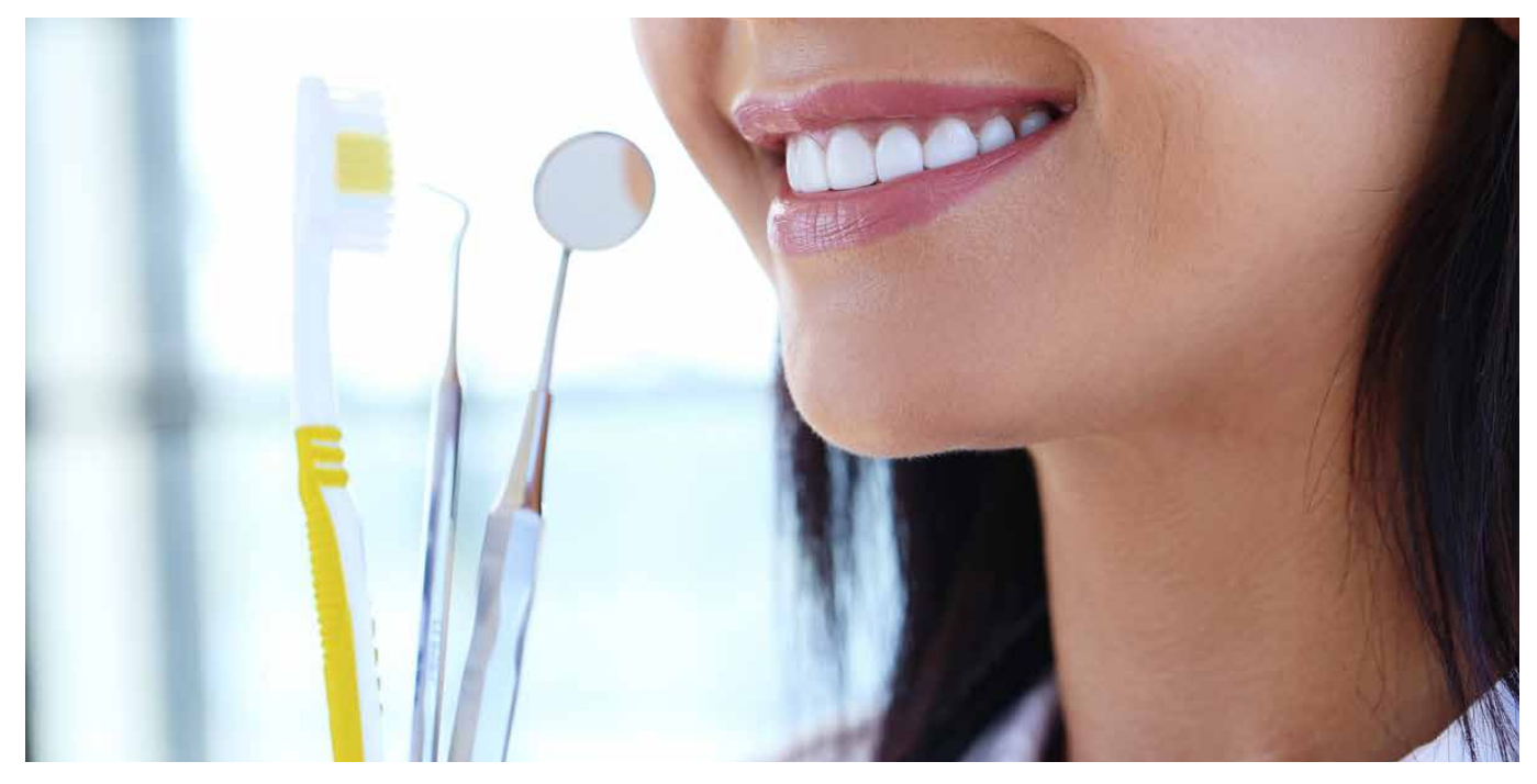
INTERTEK CLINICAL RESEARCH SERVICES